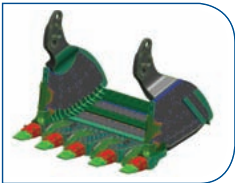
O&K RH200 Heavy Wear Kit Concept