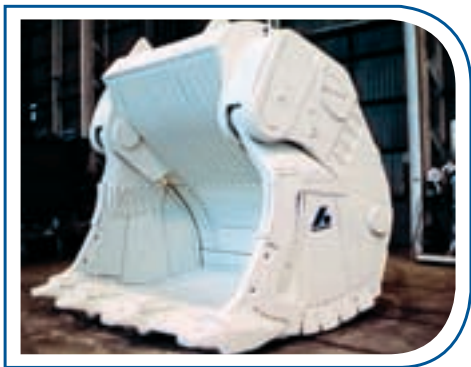
O & K RH200 Bucket