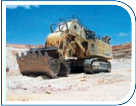
Liebherr 996 Excavator