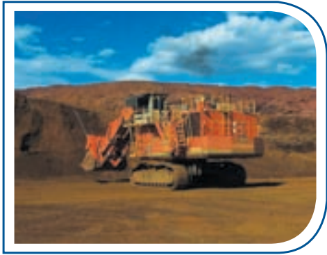
Hitachi Ex2500 in action