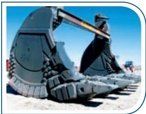
Komatsu PC8000 Jaw